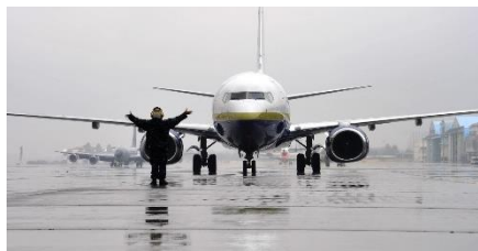
DTS Travel Authorizations