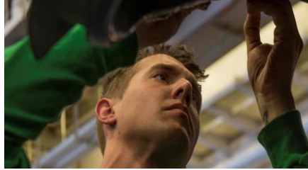
Physical Inventory Counts