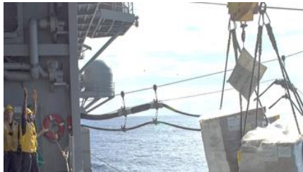
Receipt & Acceptance